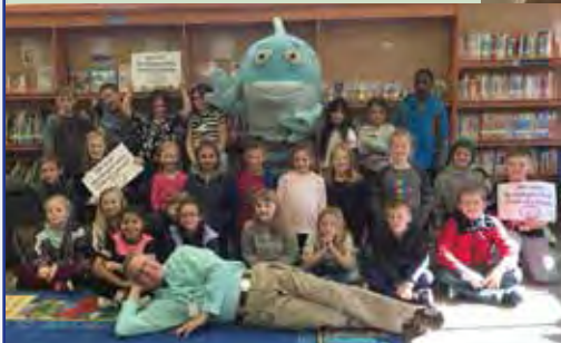
Pout-Pout Fish entertained nearly 1,600 children at 38 different programs.